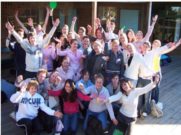
North-West Health Careers Campers

I liked talking to the students and finding out what their courses involved.