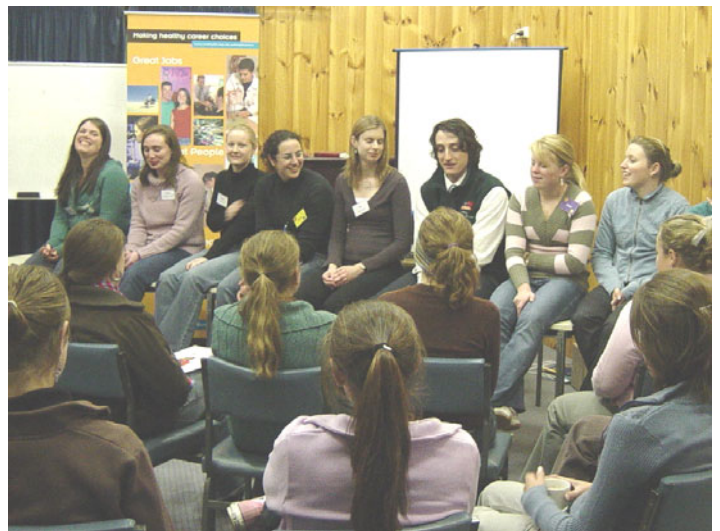
Talk to a uni student - or 8!

A great way to find out what uni is really all about.